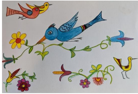
A Swiss building design