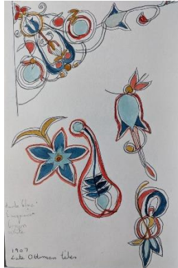
Turkish Tile Design