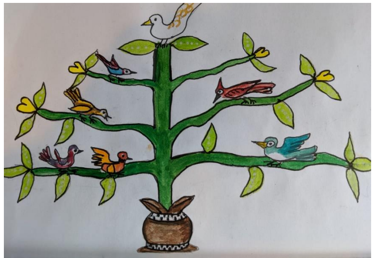
Tree of Life (USA)

Take inspiration from some of these images, or others that you have at home, create your own design. Could you use a symbol or image that is meaningful to you? You could use bits from several of these images and put them together.