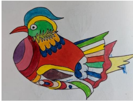
A bird from Singapore